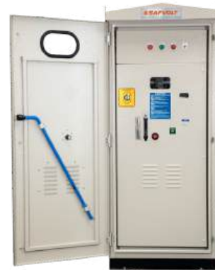
3.3kV - 5kV LIS Panel