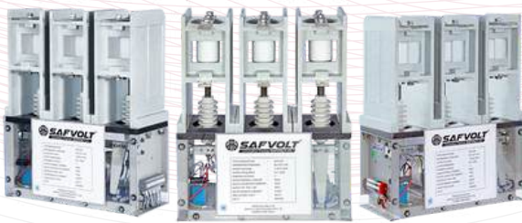
VACUUM CONTACTOR - Open Type Group