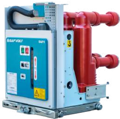
3.3kV - 12kV VCB