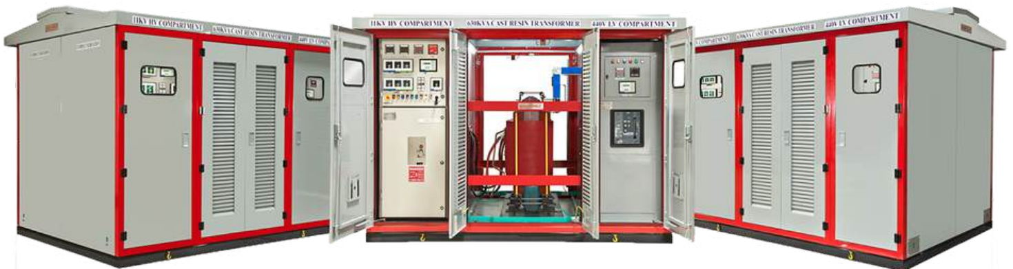
12kV-36kV Compact Sub Station