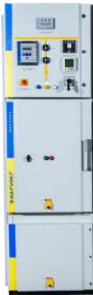
12kV Indoor VCB Panel