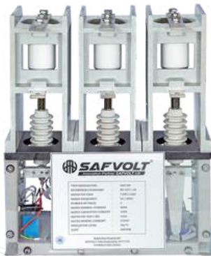
VACUUM CONTACTOR - Open Type