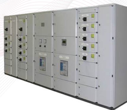
UL891 2000A SWITCHBOARD