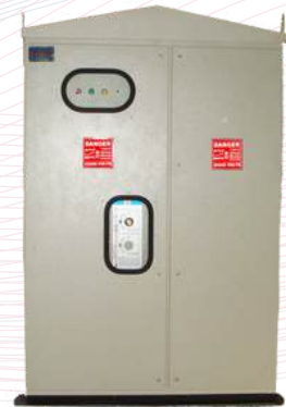
15kV LIS Panel