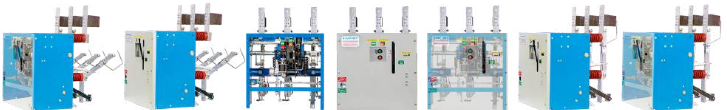
11KV - MOTORISED LIS - Overall View