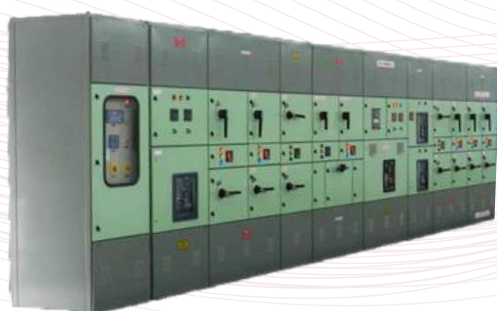
UL891 4000A SWITCHBOARD