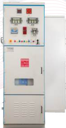
15kV - 24kV VCB Panel