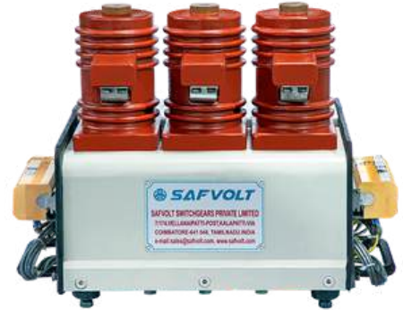
VACUUM CONTACTOR - Closed Type