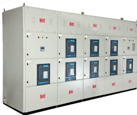
UL891 4000A SWITCHBOARD