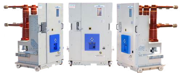
27kV - 40.5kV VCB Group