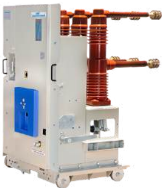
27kV - 40.5kV VCB