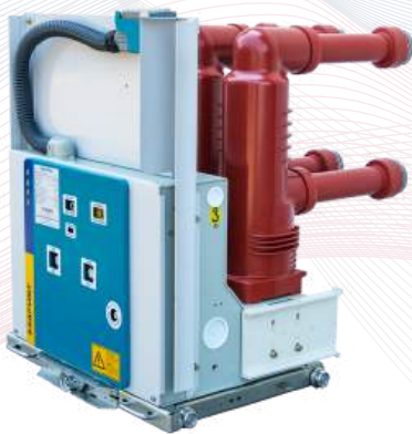
15kV - 24kV VCB