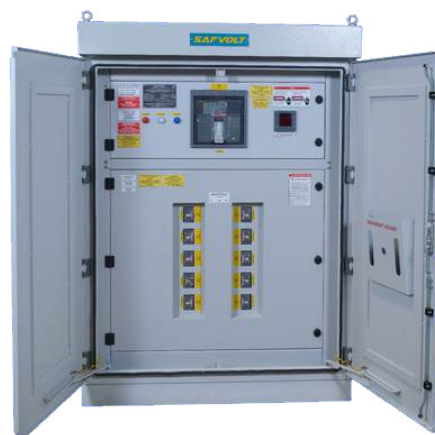
UL891 2000A EV CHARGING PDU PANEL