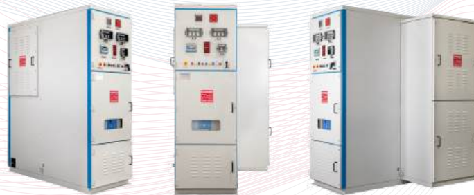
15kV- 24kV VCB Panel