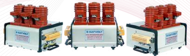
VACUUM CONTACTOR - Closed Type Group