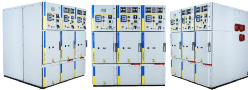
11kV VCB Panel